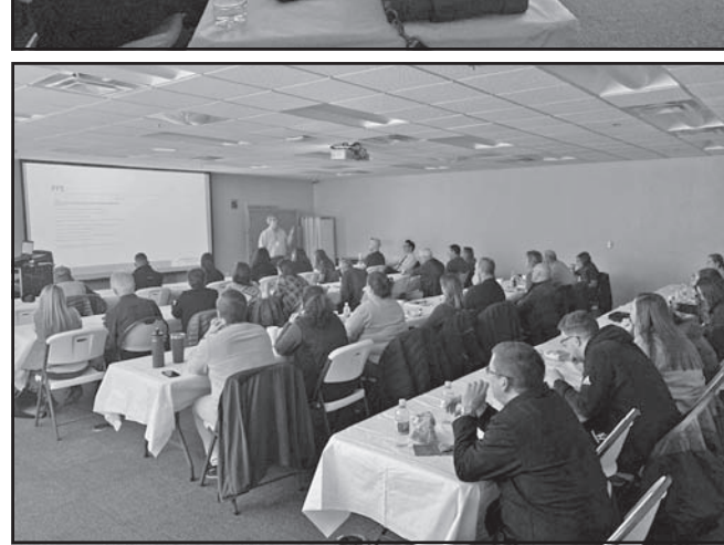
Speakers at the Union General Sports Medicine Program CME December Conference